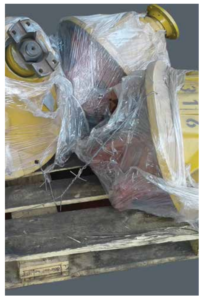
A stock of differentials as part of the maintenance planning and downtime minimisation strategy.

Inspect the drain plug for presence of excessive particles.