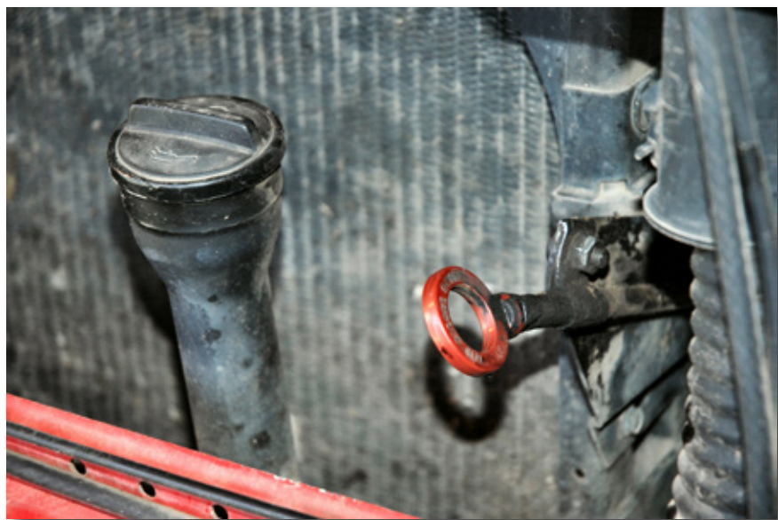
Dipstick and filler neck

And then all components outside of the engine require very specific lubricants totally different to engine lube specs.