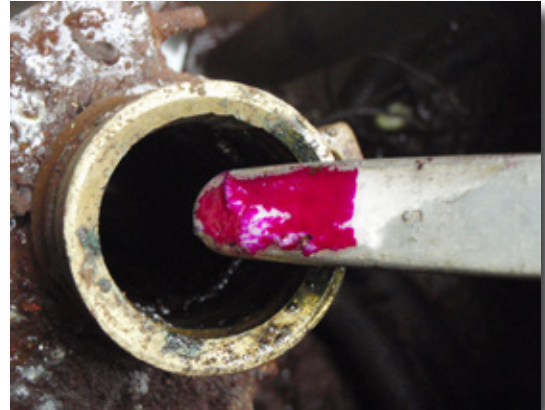
Bulk Fuel dip water test

One overlooked dipstick is that which measures bulk fuel storage levels. Fleet audits reveal the bulk fuel tank dipstick just lying on the workshop floor or even left outside in the yard. This is yet another source of contamination unconsciously introduced into the fuel tank during bulk fuel measurements. Modern common-rail diesel engine injectors operating over 2500bar are sensitive to particles over four micron – every effort must be made to avoid contamination.