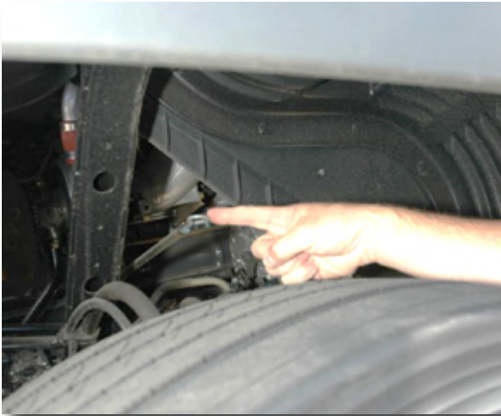
Engine oil dipstick under driver side from wheel arch